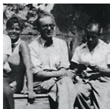
Le Corbusier, Pierre Jeanneret, Charlotte Perriand

In 1922, Le Corbusier began working in the new rue de Sèvres, Paris, atelier with his cousin Pierre Jeanneret with whom he shared research projects and design criteria in a profound and life-long professional relationship.