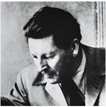
Gerrit Thomas Rietveld

Gerrit Thomas Rietveld, born in Utrecht on 24 June 1888, seems possessed of two personalities, each so distinct that one might take his work to be that of more than one artist. The first personality is that seen in the craftsman cabinet-maker working in a primordial idiom, re-inventing chairs and other furniture as if no one had ever built them before him and following a structural code all of his own; the second is that of the architect working with elegant formulas, determined to drive home the rationalist and neoplastic message in the context of European architecture. The two activities alternate, overlap, and fuse in a perfect osmosis unfolding then into a logical sequence. In 1918 Rietveld joined the "De Stijl" movement which had sprung up around the review of that name founded the year before by Theo van Doesburg. The group assimilated and translated into ideology certain laws on the dynamic breakdown of compositions (carrying them to an extreme) that had already been expressed in painting by the cubists: the "De Stijl" artists also carefully studied the architectonic lesson taught by the great Frank Lloyd Wright, whose influence was widely felt in Europe at that time.