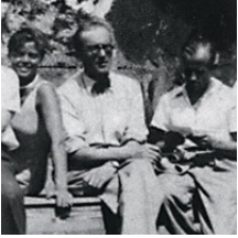
Le Corbusier, Pierre Jeanneret, Charlotte Perriand

In 1922, Le Corbusier began working in the new rue de Sèvres, Paris, atelier with his cousin Pierre Jeanneret with whom he shared research projects and design criteria in a profound and life-long professional relationship.