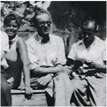
Le Corbusier, Pierre Jeanneret, Charlotte Perriand

In 1922, Le Corbusier began working in the new rue de Sèvres, Paris, atelier with his cousin Pierre Jeanneret with whom he shared research projects and design criteria in a profound and life-long professional relationship.