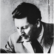
Gerrit Thomas Rietveld

Gerrit Thomas Rietveld, born in Utrecht on 24 June 1888, seems possessed of two personalities, each so distinct that one might take his work to be that of more than one artist. The first personality is that seen in the craftsman cabinet-maker working in a primordial idiom, re-inventing chairs and other furniture as if no one had ever built them before him and following a structural code all of his own; the second is that of the architect working with elegant formulas, determined to drive home the rationalist and neoplastic message in the context of European architecture. The two activities alternate, overlap, and fuse in a perfect osmosis unfolding then into a logical sequence. In 1918 Rietveld joined the "De Stijl" movement which had sprung up around the review of that name founded the year before by Theo van Doesburg. The group assimilated and translated into ideology certain laws on the dynamic breakdown of compositions (carrying them to an extreme) that had already been expressed in painting by the cubists: the "De Stijl" artists also carefully studied the architectonic lesson taught by the great Frank Lloyd Wright, whose influence was widely felt in Europe at that time.