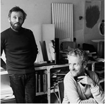
Ronan & Erwan Bouroullec

Ronan Bouroullec (born 1971) and Erwan Bouroullec (born 1976) have been working together for about twenty years now. Their collaboration is a permanent dialogue nourished by their distinct personalities and a shared notion of diligence with the intention to reach more balance and fineness. Their work has covered many fields ranging from the design of small objects as jewellery to spatial arrangements and architecture, from craftsmanship to industrial scale, from drawings to videos and photography. They have collaborated with leading design companies such as Vitra, Cassina, Artek, Danskina, Magis, Alessi, Galerie kreoo, Established & Sons, Axor Hansgrohe, Flos, Kvadrat, Glas Italia, Kartell, Kettal, Iittala, Cappellini, Ligne Roset, Nani Marquina, Mattiazzi, Mutina, Samsung and Hay. Designs of Ronan & Erwan Bouroullec are part of select international museums' permanent collections and several exhibitions have been devoted to their work including the Design Museum, London, the Museum of Contemporary Art, Los Angeles, the Centre Pompidou Metz, the Museum of Contemporary Art, Chicago, the Musée des Arts Décoratifs in Paris, the Vitra Design Museum or the FRAC Bretagne. The Bouroullec studio is located in Paris, and the whole team numbers around eight people. To discover more about Ronan & Erwan Bouroullec's work, please visit www.bouroullec.com